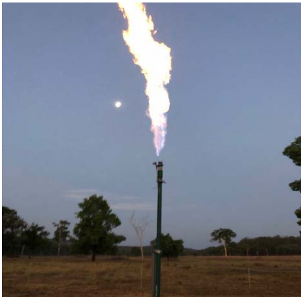
Gas flare at Nyanda-4 on 9 January 2020

Production testing commenced at Serocold-1 in the central area of the permit on 17 January 2020 and early signs of gas production were also seen within a week. However as with Nyanda-4, pump problems and wet weather intervened and dewatering was shut down 6 .