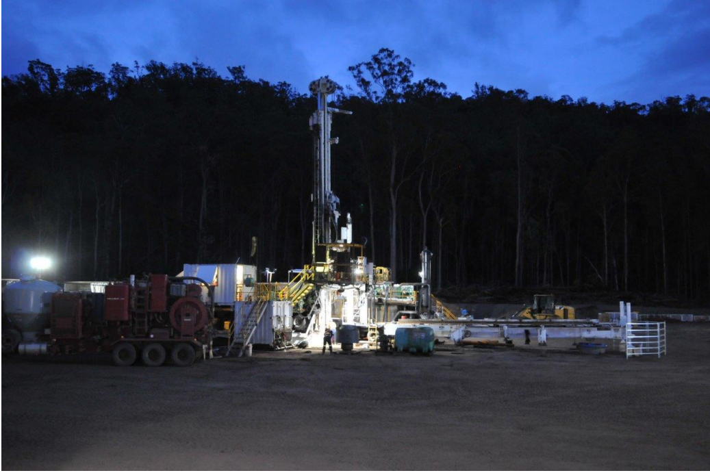
Silver City Drilling Rig 25 at Nyanda-8