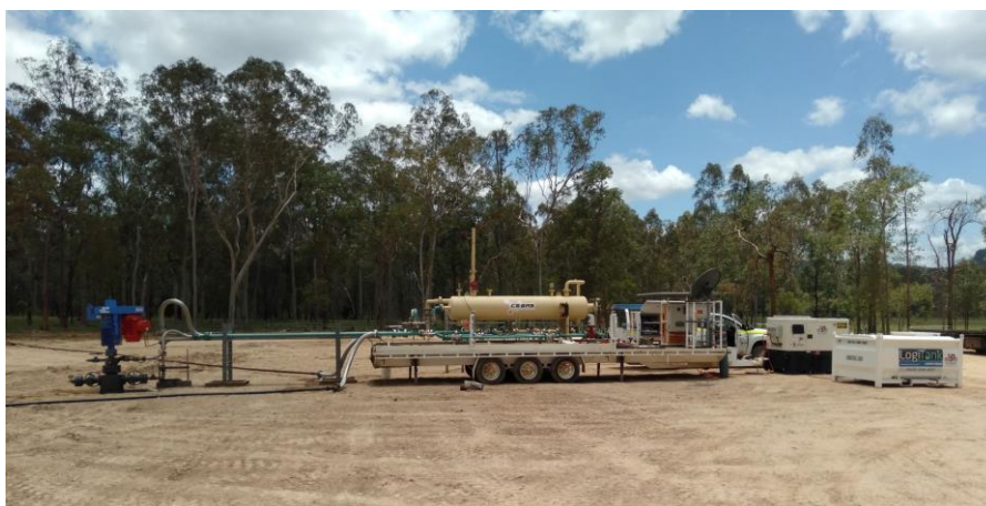
Production testing at the Nyanda-7 well, January 2021

State Gas will continue to update the market as production testing continues.