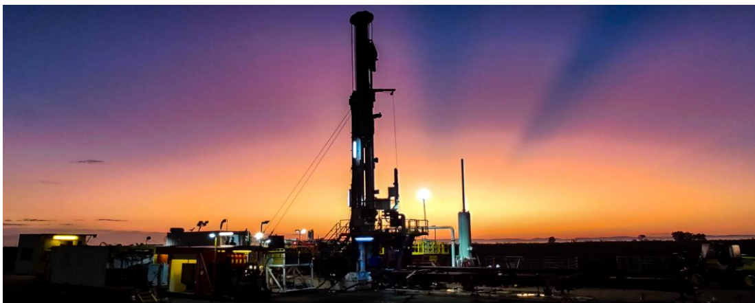
Drilling at Rougemont-3