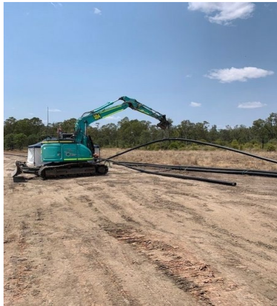
Figure 2: Installation of gathering system