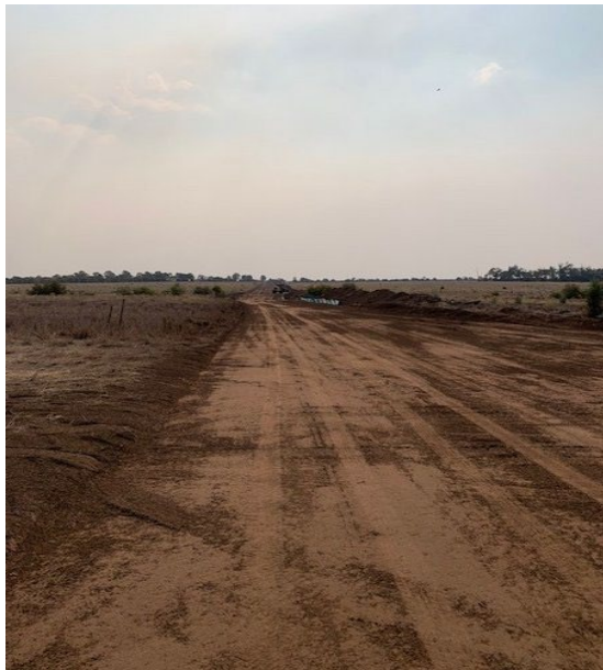
Figure 1: Enabling civil works – construction of tracks, laydown area and longer term access road