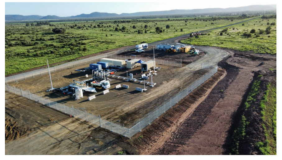
Figure 1: Near completed CNG Facility (15 January 2024)

The work undertaken to weather-proof the access road and CNG facility pad have proven worthwhile with the site remaining in good condition despite continuous rain over the last few weeks. The Company is confident that mechanical completion and plant commissioning can proceed even if wet weather persists. It also means that post commissioning, State Gas will be able to maintain continuous truck access to the facility, which will be critical for continuity of our future gas supply commitments.