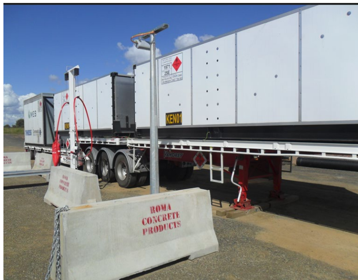
Figure 5: Loading post and virtual pipeline trailers.

The provision of CNG using the Virtual Pipeline is a bundled gas supply solution, which reflects significant added value when compared to raw natural gas sourced from the traditional pipeline network. Raw coal seam gas from Rougemont 2/3 is processed by the CNG Facility to meet gas specifications and pressures required for the efficient operation of the hybrid mine-truck engines. The ability for State Gas to supply flexible quantities of CNG to locations remote from traditional pipeline infrastructure is a unique aspect of State Gas' value proposition. As such, the contracted price for CNG under this supply arrangement is at a premium to the spot price of raw pipeline gas.