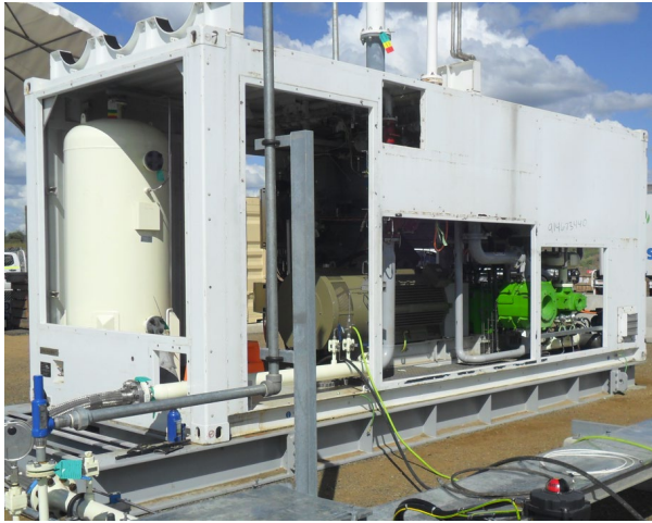
Figure 3: Commissioned modular compressor package, capable of compressing up to 1.7TJ of natural gas per day