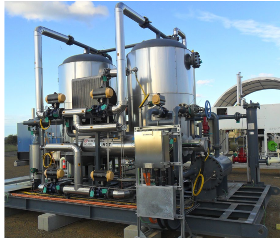
Figure 4: Commissioned dehydrator package, capable of reducing moisture content to less than 35mg/sm 3