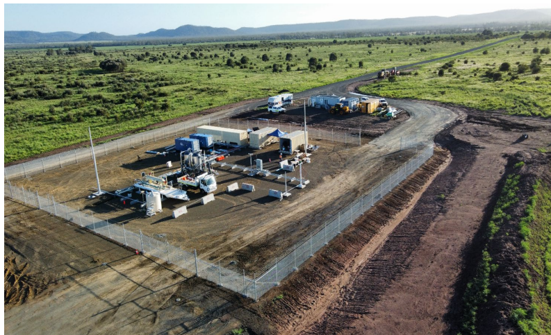
Figure 1: Completed CNG Facility including all weather access road (top of photo) leading to Carnarvon Highway.

(“State Gas or “the Company”) is pleased to provide this update for the quarter ended 31 March 2024 (“the Quarter”). During the Quarter, the Company achieved both mechanical and practical completion of its “first-of-its-kind” in Australia, coal seam gas (“CSG”) to compressed natural gas (“CNG”) plant (“the CNG Facility”).